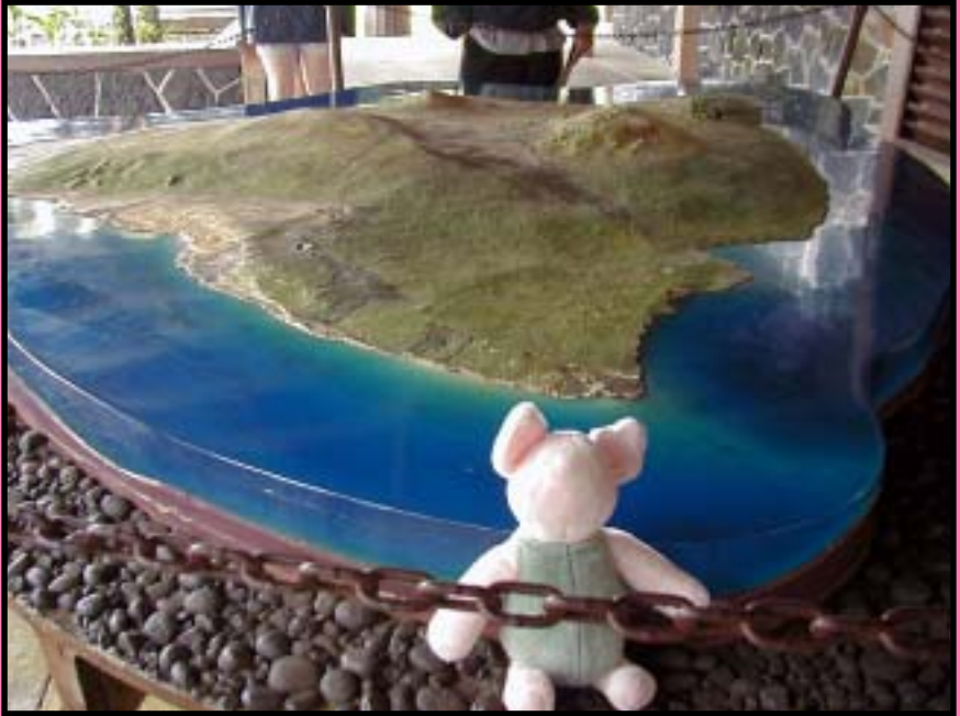
Pigletté poses in front of a model of the big island of Hawaii at Volcano National Park.